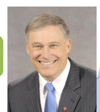
Jay Inslee Governor